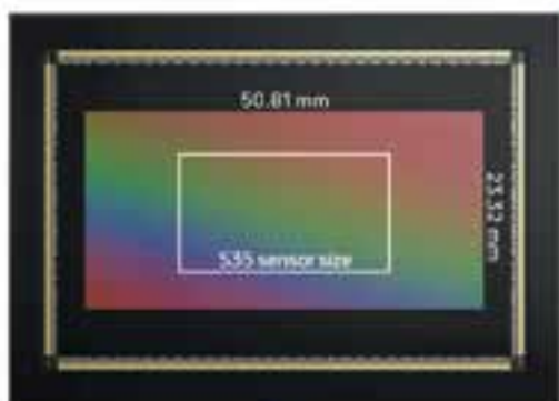
Actual Ursa Cine 65 sensor size